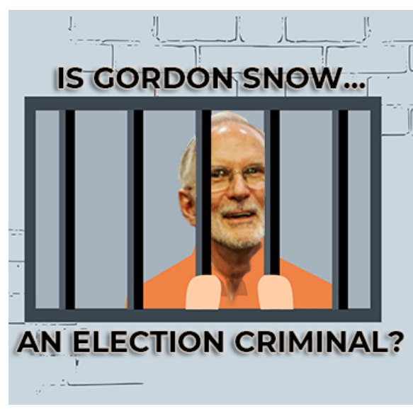
Article featured image

Below is his biography as seen on the <u>Alpena Public Schools website</u>: